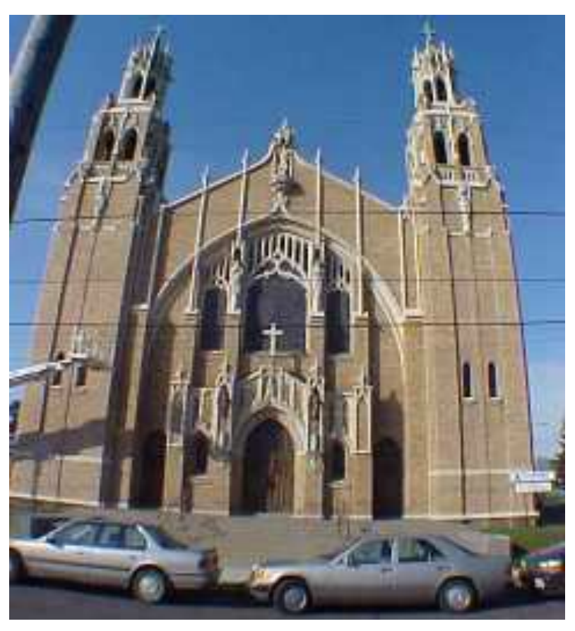
St. Andrew's Church in Portland, OR