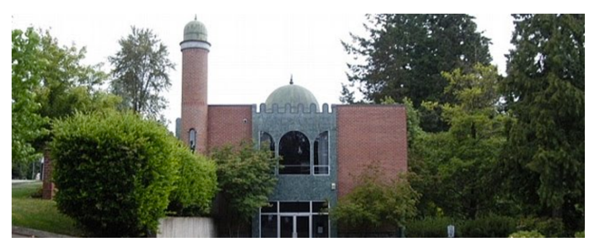
Rizwan Mosque in Portland, OR